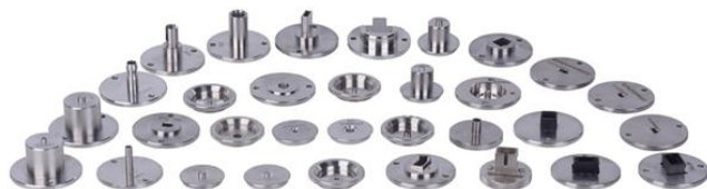
Series of Adaptors